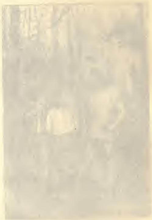
The Boy Captives